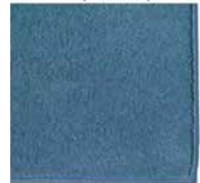
▲ Bound Edging