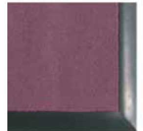
▲ Low Profile Vinyl Edging (Standard)